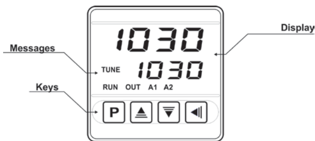
Fig. 02 - Identification of the parts referring to the front panel

The controller's front panel, with its parts, can be seen in the Fig. 02: