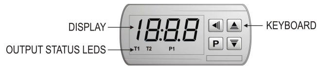
Figure 2 – Front Panel

The signaler P1 at the front panel of the controller will light up when the control output is activated.