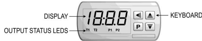
Figure 2 – Front Panel

The signaler P1 at the front panel of the controller will light up when the control output is activated. The signaler P2 light up when the booster output is activated.